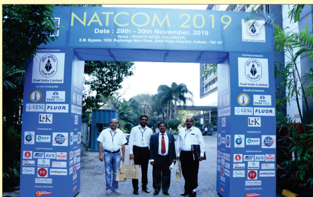
Natcom 2019 participants