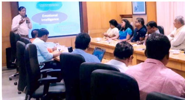
Lecture Session - 4