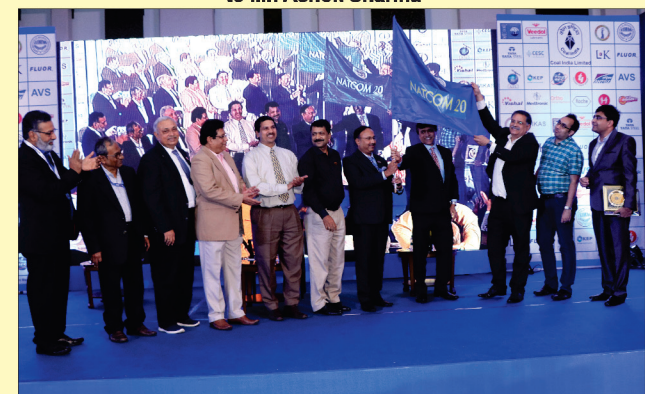
Handing over of Natcom Flag by Kolkata Branch to National President