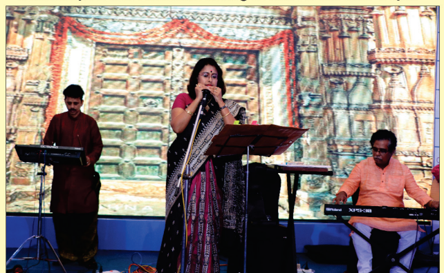
Cultural Programme at Natcom - 2019