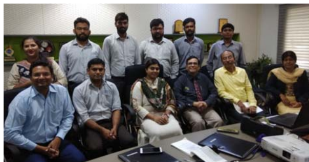
Group Photo of the above Training Program