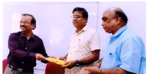
Lecture Session - 3

IIMM, Nalconagar Branch/Bhubaneswar Chapter Organized the 4th Lecture Session in IOCL Conference Hall in their State Marketing Office at Chandra-sekharpur, Bhubaneswar on 17th November 2019.