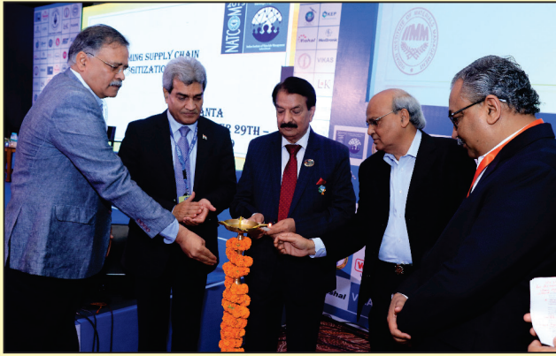
Lighting of Lamp by the Chief Guest and other dignitaries at NATCOM 2019