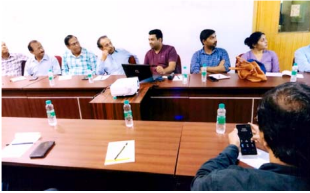
Lecture Session - 1