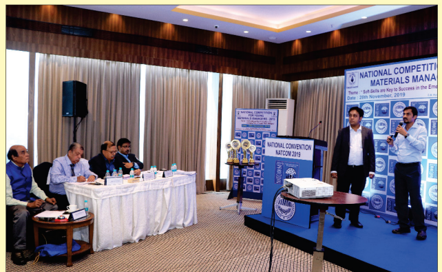
View of YMM Competition at Natcom - 2019