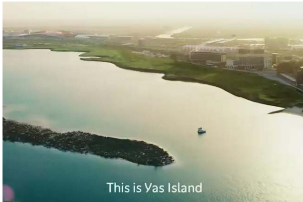
This is Vas Island

India had avoided framing any industrial policy after the liberalisation of its economy in 1991, because 'industrial policy' had become taboo in the 'leave it to the market' ideology of the Washington Consensus, which said that any deliberate attempt by the government to grow industry would always be counter-productive.